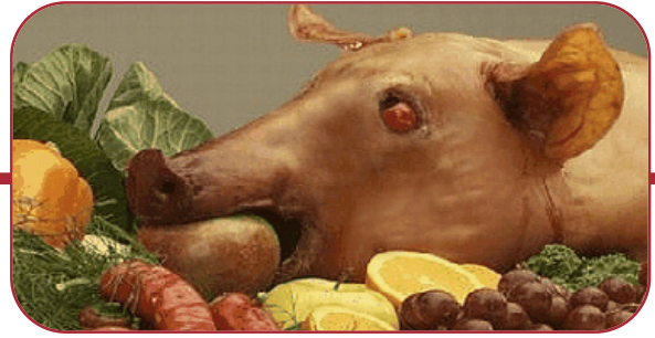
Displayed with apple in mouth and cherries in the eyes.

2135 Bustard Road, Suite 8, Lansdale PA 19446 610-584-6212 • www.allaboutcatering.com